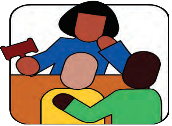
Fig. 20.2: Consumer Protection

The Government of India has accepted, established and enshrined six consumer rights under the Consumer Protection Act (CPA)1986 . There are four basic rights— (i) right to safety, (ii) right to be informed, (iii) right to choose and (iv) right to be heard. Two additional rights areright to redressal and right to education.